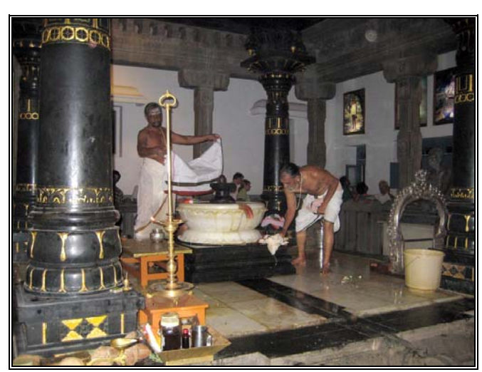
Special Puja at Sri Bhagavan's Shrine on Sivaratri.

It was an unforgettable experience for devotees who kept vigil throughout the night and went round the Hill.