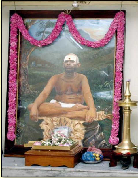
Sri Bhagavan's Decorated Picture.

Bhagavan Sri Ramana Maharshi's enlightenment day was celebrated on 17th July with usual fervor at Sri Ramana Manthiram, the place where Sri Bhagavan became enlightened through his death experience at the age of 16 during his stay at Madurai.