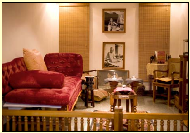
Furniture Room off main courtyard showing 'Yogasana' sofa mattress etc

The Guiding Presence of Sri Ramana – K. K. Nambiar – pp 49–50, 1997 reprint – pub. Sri Ramanasramam