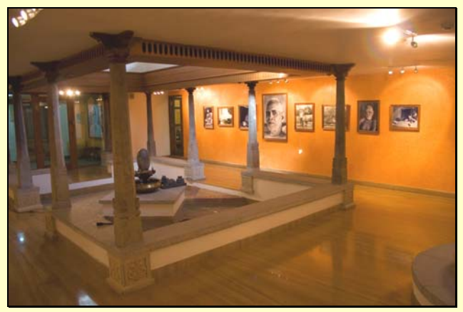
Archives - Main Courtyard

Following are three direct quotations from books regarding particular objects on view in the main area: