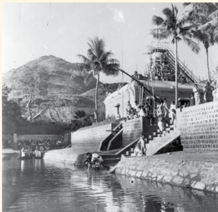
Kumbhabhishekam of the Mother’s Shrine

In the spring of 1950, my brother informed me that Bhagavan’s condition was critical so I took a one-