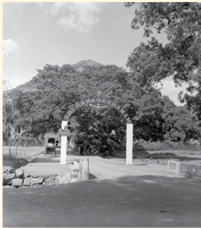
Early Ashram Front Gate