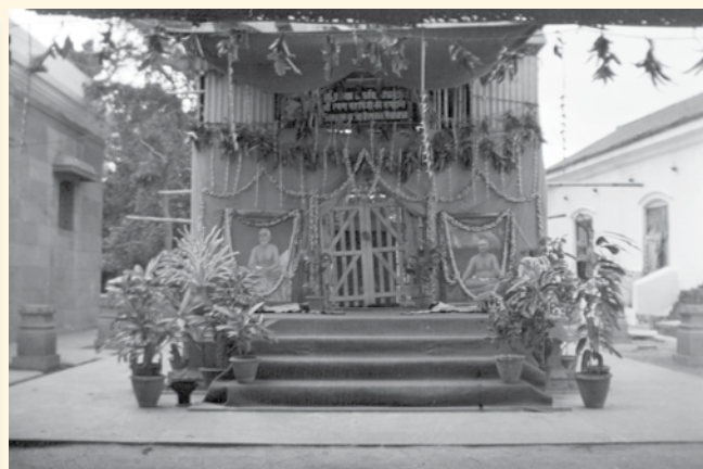
Bhagavan’s Early Samadhi Shrine