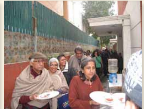
Ramana Kendra Delhi meeting in early 2012

To propagate the teachings of Sri Ramana, several centres have come up both in India and abroad. In Delhi in 1960, like-minded friends got together to recapitulate and share the experiences of their association with Bhagavan at Sri Ramanasramam, little realizing that this meeting would gather momentum and grow into a dynamic centre for sadhana, study and service dedicated to the Maharshi's philosophy. Thanks to the initiative of these ardent devotees, Ramana Kendra, Delhi, came into being and was registered as a society on 28th March, 1963.