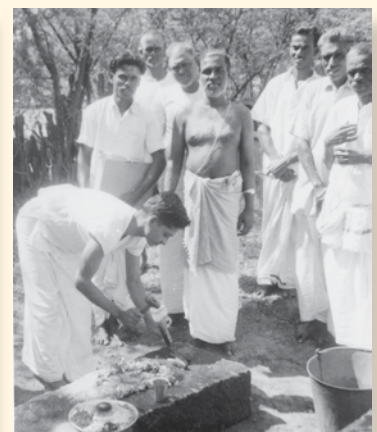
Samadhi Hall’s First Stone, 1967