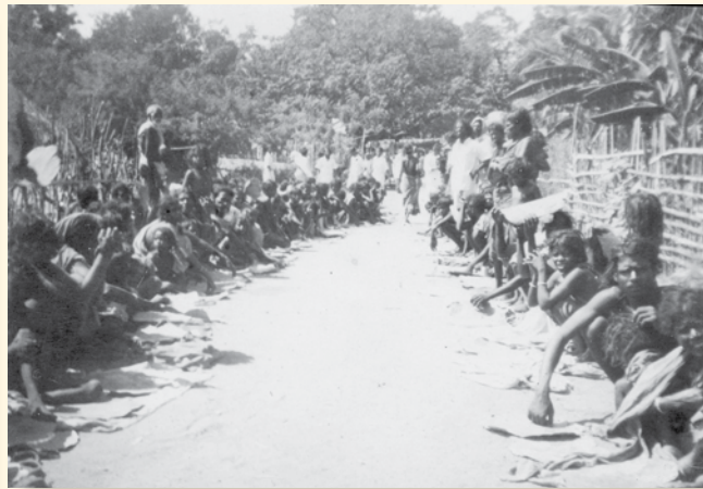
Early Ashram Narayana Seva