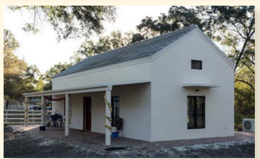
Newly inaugurated Old Hall replica in Tampa