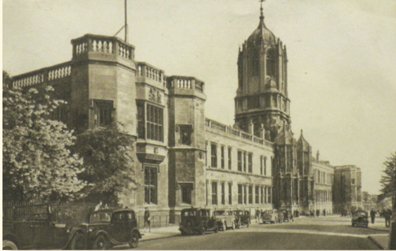
Christ Church, Oxford, ca. 1925