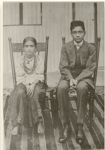
KS and Visalakshi: wedding day, 1915