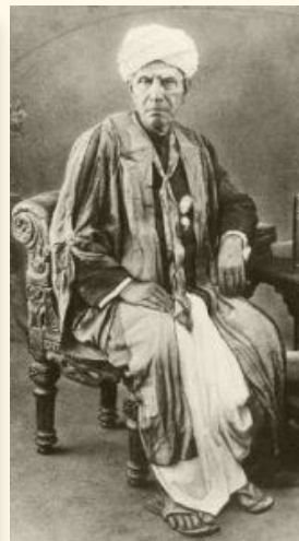
U. V. Swaminatha Iyer, thatha of Tamil