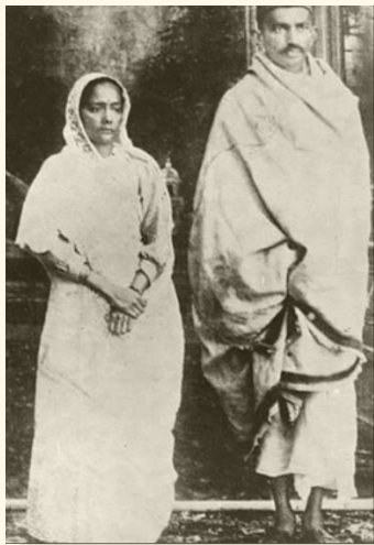
Gandhi and his wife Kasturba (1915)

1 Uttamadhanapuram Venkatasubbaier Swaminatha Iyer (1855–1942) of Suriaymoolai near Kumbakonam brought to public attention major literary works in Tamil, having collected over 3,000 palm-leaf manuscripts. Swaminatha Iyer went knocking door-to-door at the homes of learned men in search of Sangam classics, editing and publishing them. Among other notable publications was his 1887 publication of Cevaka Cintamani .