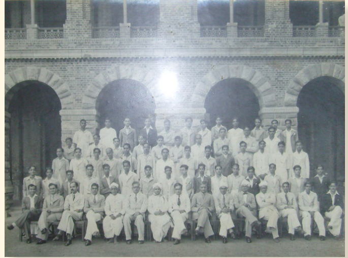
Presidency College, Madras, 1941