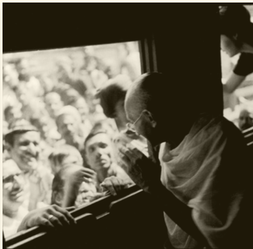
After Independence (1947)