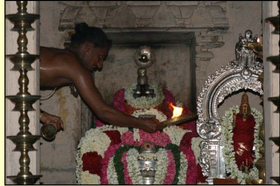
Aarati at Sri Mathrubhuteswara Shrine