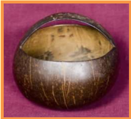
Carved Coconut Kamandhelu - (Nirvana Room)

Some other articles on show or stored in the Ramanasramam Archive