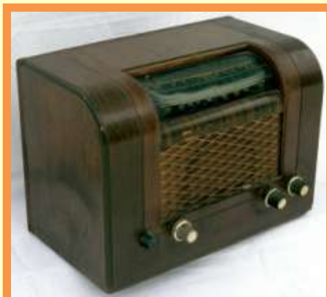
Old Hall radio - mentioned in 'Talks'