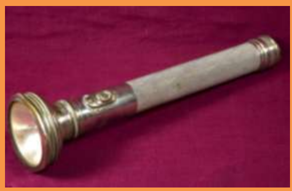
Sri Ramana's Torch (Nirvana Room)