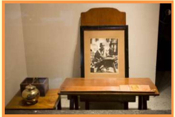
Niranjanananda Swami Office display