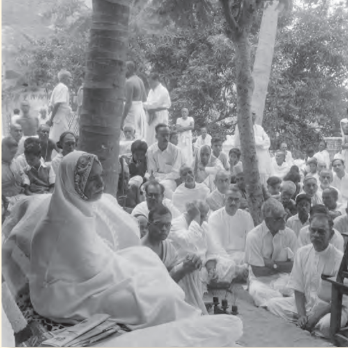
Bhagavan at Skandasramam with devotees (26th Nov. 1945)

Skandasramam has since been declared an historical and cultural treasure of India under the Ancient Monuments and Archaeological Sites and Remains Act of 1958.