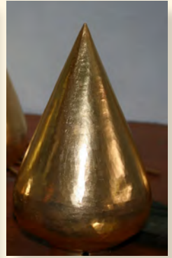
Vimanam Kalasala Crown

the domes was restored in a lengthy process involving extensive polishing and electrolysis, executed by specialists from Kumbakonam. Some of the internal wooden support poles for the kalasa were replaced. The kalasa atop Rajagopuram were, for the first time, plated in gold. On the eastern and southern portions of the Samadhi Hall-New Hall complex, rooftop drains were cloaked with six lifelike sculpted crocodiles typical in Saivite and Vaishnavite temples. These ornamental rainwater drains conceal water pipes which travel down through the center of their tails and discharge through open jaws dauntingly replete with large fangs.