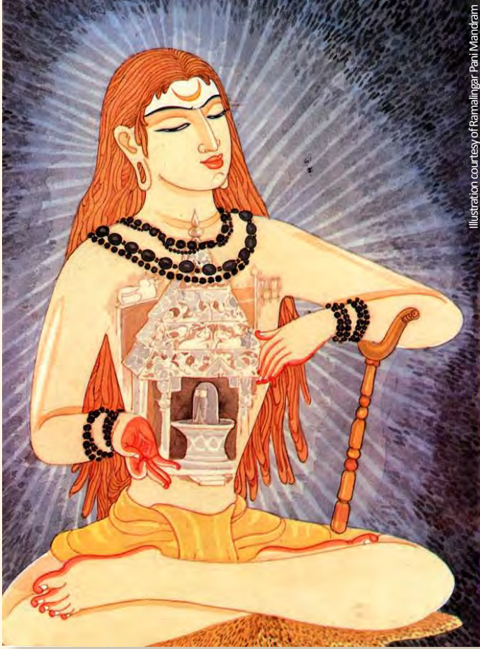
Illustration courtesy of Ramalingar Pani Mandram