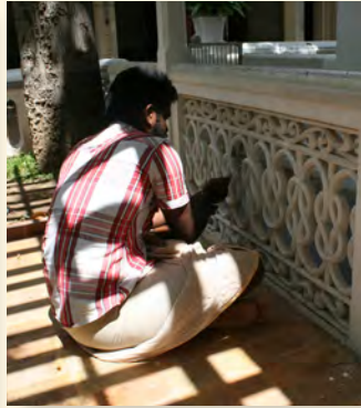
Repairs on the Nirvana Room Grillwork