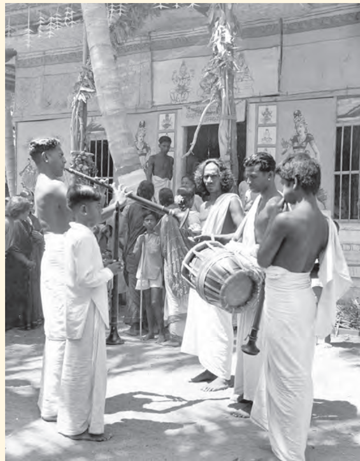
Mahakumbhabhishekam, 14-17th March, 1949