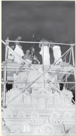
17th March, 1949