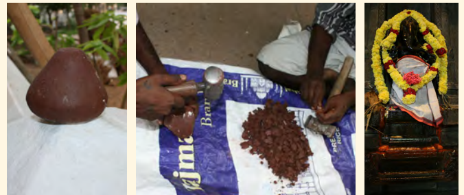
Pounding of ashthabandha cakes just before heating and application; Mother's Shrine Vinayaka with newly applied seal.

Other key points are the gopura (temple towers) and vimanas (the domes above central shrines). Vimanas are especially crucial to the vital functioning of a temple as the divine power of the deity or linga below is said to emanate through these domes. When the temple is viewed as a human form, the vimanam is the head. Vimanas are crowned with special coronal 'pots' called kalasa which require periodic care. A vimana without its sacred kalasa