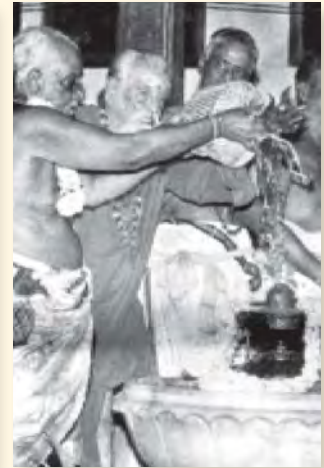
3rd November, 2004

of funds. By July 1964 the central structure of the shrine with polished black granite pillars was in place. By August 1966 the vimanam above the Samadhi and a second granite exterior around the Samadhi were inaugurated. During the years of renovation, the New Hall had been functioning as Bhagavan's Shrine for daily Vedaparayana and puja, and thus it proved necessary to 'transfer the shakti' back to Bhagavan's Samadhi proper. For this reason and by virtue of the fact that the permitted gap of twelve years had long since elapsed, kumbhabhishekam was performed on the 18th of June, 1967, to inaugurate the newly completed mantapam and vimanam and to rededicate the Mother's Shrine.