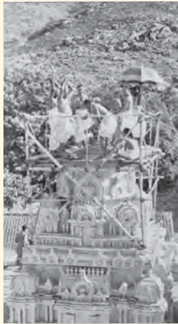
18th June, 1967