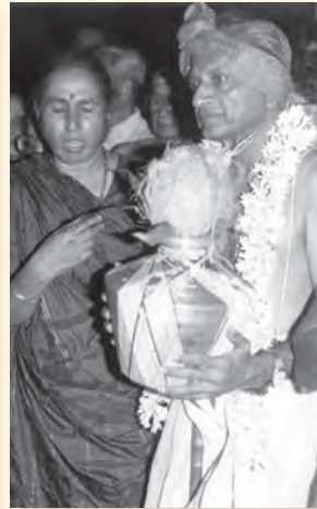
7th July, 1995