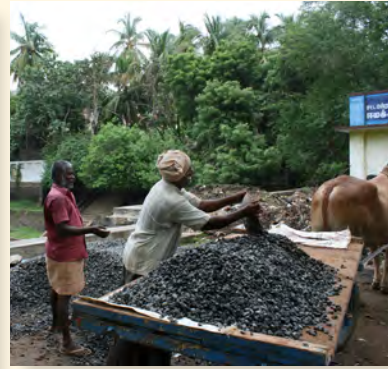
Pali Tirtham Project