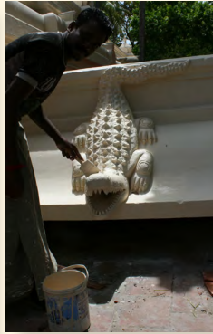
Ornamental Rainwater Drains