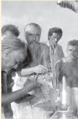
22nd November, 1979